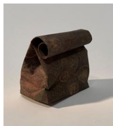
Double Life, Ghost #19, 2019

Viscosity monotype and soft ground etching Hand cut and folded on Akatosashi