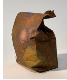
Double Life, #21, 2019 Viscosity monotype and soft ground etching Hand cut and folded on Akatosashi 4 1/2 x 2 1/4 x 3 3/4 inches SOLD

Viscosity monotype and soft ground etching Hand cut and folded on Akatosashi 2 3/4 x 5 x 4 1/2 inches $4500, all 4 works in the group