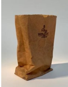
Double Life Decay, Number 1, 2019 Ghost 6, #28

Viscosity monotype and soft ground etching Hand cut and folded on Akatosashi 5 3/4 x 3 x 3 3/4 inches $4500, all 4 works in the group