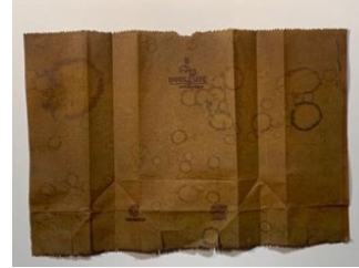
Double Life, Offset #31, 2019 Viscosity monotype and soft ground etching Hand cut and folded on Akatosashi 8 x 12 x 1/4 inches $1700 (framed)