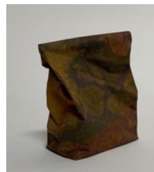
Double Life, #6, 2019

Viscosity monotype and soft ground etching Hand cut and folded on Akatosashi