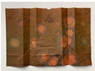
Double Life, #20, 2019 Viscosity monotype and soft ground etching Hand cut and folded on Akatosashi 8 x 12 x 1/4 inches $1700 (framed)