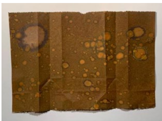
Double Life, #31, 2019 Viscosity monotype and soft ground etching Hand cut and folded on Akatosashi 8 x 12 x 1/4 inches $1700 (framed)