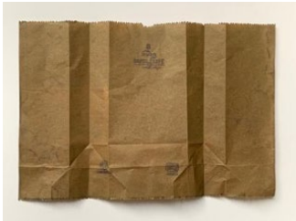
Double Life, Offset #26, 2019 Viscosity monotype and soft ground etching Hand cut and folded on Akatosashi 8 x 12 x 1/4 inches $1700 (framed)