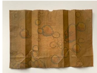
Double Life, Offset #30, 2019 Viscosity monotype and soft ground etching Hand cut and folded on Akatosashi 8 x 12 x 1/4 inches SOLD