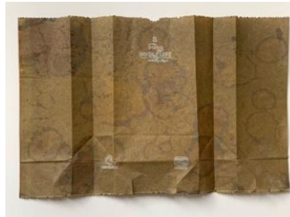
Double Life, Offset #25, 2019 Viscosity monotype and soft ground etching Hand cut and folded on Akatosashi 8 x 12 x 1/4 inches SOLD