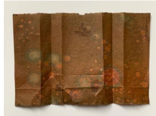
Double Life, #19, 2019 Viscosity monotype and soft ground etching Hand cut and folded on Akatosashi 8 x 12 x 1/4 inches SOLD