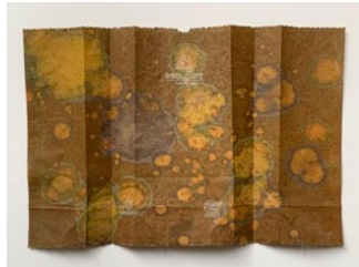
Double Life, #25, 2019 Viscosity monotype and soft ground etching Hand cut and folded on Akatosashi 8 x 12 x 1/4 inches SOLD