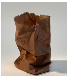
Double Life, Offset #9, 2019

Viscosity monotype and soft ground etching Hand cut and folded on Akatosashi 5 1/2 x 3 1/4 x 3 3/4 inches SOLD