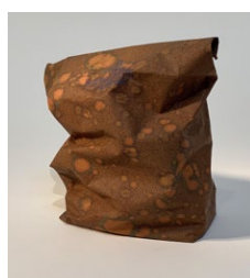
Double Life, #27, 2019

Viscosity monotype and soft ground etching Hand cut and folded on Akatosashi