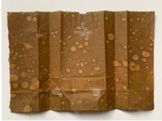
Double Life, #26, 2019 Viscosity monotype and soft ground etching Hand cut and folded on Akatosashi 8 x 12 x 1/4 inches $1700 (framed)