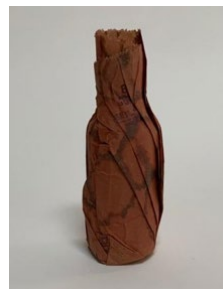
Double Life, Ghost #8, 2019 Viscosity monotype and soft ground etching Hand cut and folded on Akatosashi SOLD

Viscosity monotype and soft ground etching Hand cut and folded on Akatosashi 5 1/2 x 3 1/4 x 3 3/4 inches SOLD