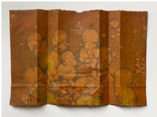
Double Life, #17, 2019 Viscosity monotype and soft ground etching Hand cut and folded on Akatosashi 8 x 12 x 1/4 inches $1700 (framed)