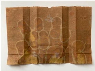
Double Life, Ghost #17, 2019 Viscosity monotype and soft ground etching Hand cut and folded on Akatosashi 8 x 12 x 1/4 inches $1700 (framed)