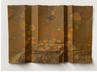
Double Life, #13, 2019 Viscosity monotype and soft ground etching Hand cut and folded on Akatosashi 8 x 12 x 1/4 inches $1700 (framed)