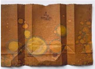
Double Life, #18, 2019 Viscosity monotype and soft ground etching Hand cut and folded on Akatosashi 8 x 12 x 1/4 inches $1700 (framed)