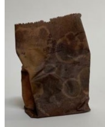
Double Life, Ghost #6, 2019 Viscosity monotype and soft ground etching Hand cut and folded on Akatosashi SOLD

Viscosity monotype and soft ground etching Hand cut and folded on Akatosashi 5 3/4 x 3 x 3 3/4 inches $4500, all 4 works in the group