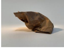
Double Life Decay, Number 3, 2019 Ghost 1, #28

Viscosity monotype and soft ground etching Hand cut and folded on Akatosashi 2 3/4 x 5 x 4 1/2 inches $4500, all 4 works in the group