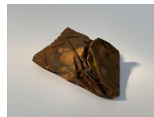
Double Life Decay, Number 4, 2019 #28 Viscosity monotype and soft ground etching Hand cut and folded on Akatosashi 2 x 5 x 6 inches $4500, all 4 works in the group