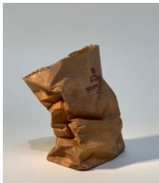
Double Life Decay, Number 2, 2019 Ghost 3, #28

Viscosity monotype and soft ground etching Hand cut and folded on Akatosashi 5 1/4 x 4 x 4 inches $4500, all 4 works in the group