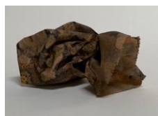
Double Life, #12, 2019

Viscosity monotype and soft ground etching Hand cut and folded on Akatosashi