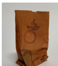
Double Life, Offset #28, 2019

Viscosity monotype and soft ground etching Hand cut and folded on Akatosashi