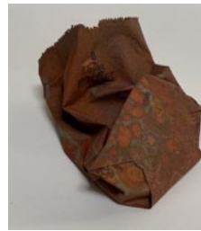
Double Life, #14, 2019 Viscosity monotype and soft ground etching Hand cut and folded on Akatosashi $1500

Viscosity monotype and soft ground etching Hand cut and folded on Akatosashi 5 1/4 x 4 x 4 inches $4500, all 4 works in the group