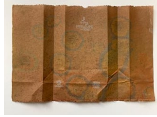
Double Life, Offset #20, 2019 Viscosity monotype and soft ground etching Hand cut and folded on Akatosashi 8 x 12 x 1/4 inches $1700 (framed)