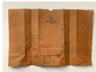
Double Life, Offset #19, 2019 Viscosity monotype and soft ground etching Hand cut and folded on Akatosashi 8 x 12 x 1/4 inches SOLD