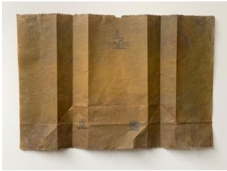
Double Life, Offset #13, 2019 Viscosity monotype and soft ground etching Hand cut and folded on Akatosashi 8 x 12 x 1/4 inches $1700 (framed)