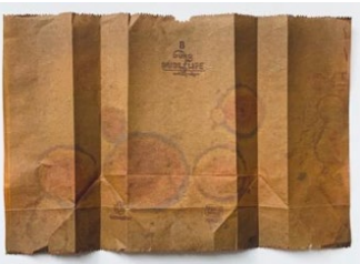
Double Life, Offset #18, 2019 Viscosity monotype and soft ground etching Hand cut and folded on Akatosashi 8 x 12 x 1/4 inches $1700 (framed)